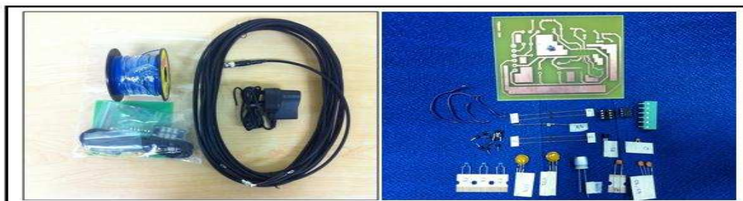
FIGURE 2 UKM-SID kit

Two workshops were held within the duration of this competition. The first workshop was conducted for engineering undergraduate students that have been selected as mentors for this program. The workshop was meant to provide the mentors with a brief introduction on the program objectives and how to conduct the experiment. The second workshop was conducted for high school students and teachers at the National Space Centre, National Space Agency. During this workshop, the SID module and teaching kit inclusive of software, electronic components and a PCB were distributed to the participating schools. The main parts of UKM-SID system was composed of an antenna, pre-amplifier circuit and a computer with a sound card. Figure 2 shows the UKM-SID kit that was provided to the participants.