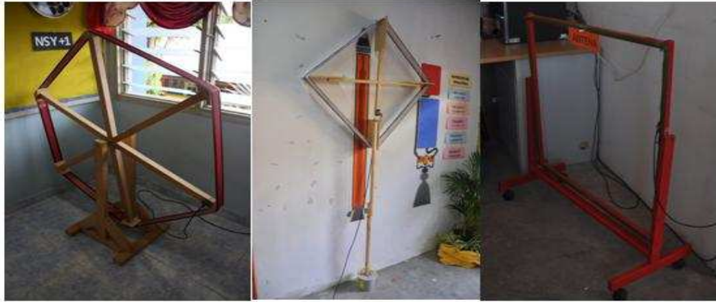
FIGURE 3 Examples of VLF Antenna Builds by Students

Students were also required to prepare and, upload a proposal, 2 progress reports and a final technical report online to be evaluated by a panel of judges. Upon submission of the reports, students were also required to answer a few technical questions regarding space weather.